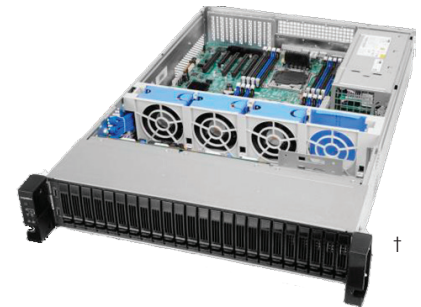
Figure 3. 2U Reference Platform