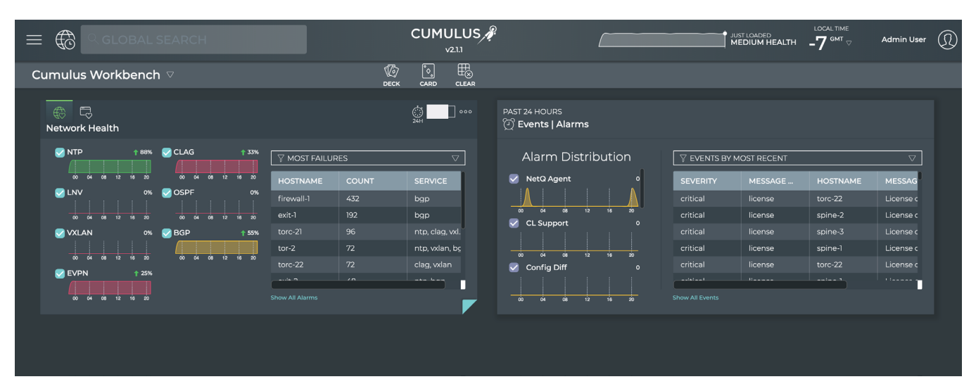
Figure 4. Cumulus NetQ dashboard

WJH can also be integrated with third-party software such as Apstra and Cumulus NetQ to provide rich and comprehensive visibility into datacenter networks.