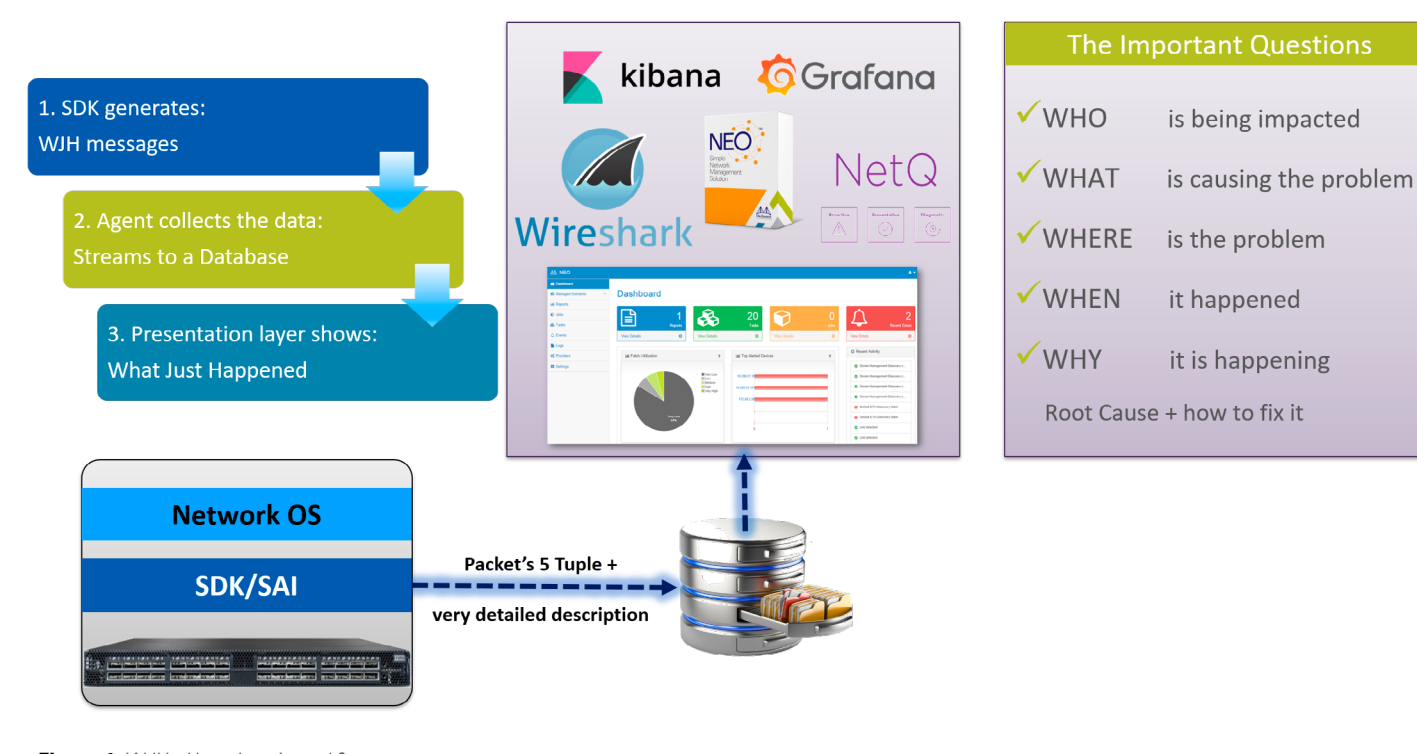
Figure 1. WJH - How does it work?